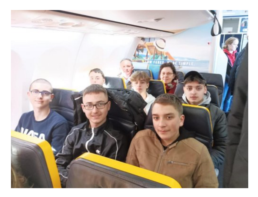
. Some of them took the plane for the first time