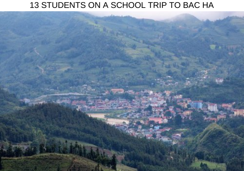
, NORTHERN VIETNAM

A project, initiated in June 2022, was to send students, specialised in topography to Bac Ha, Lao Cai province, Northern Vietnam. The latter were expected to practise and demonstrate their technical and professional skills. The project was built in partnership with the Nouvelle-Aquitaine Region, the Ministry of Foreign Affairs and Europe.