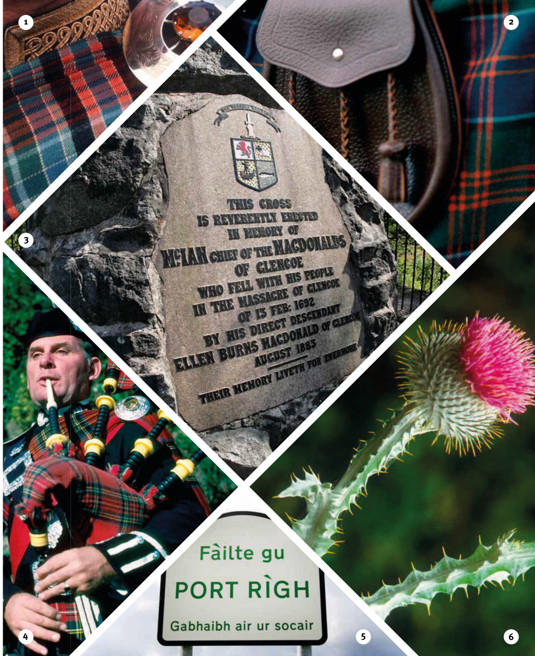
Image: Flowering thistle plant

Alongside tartan, the thistle is perhaps one of the most identifiable Scottish symbols. Legend has it that the thistle was adopted as the symbol of Scotland after it saved a sleeping party of Scottish warriors from ambush. The story goes that an unsuspecting member of an invading Norse army trod on one barefoot and roused the sleeping Scots.