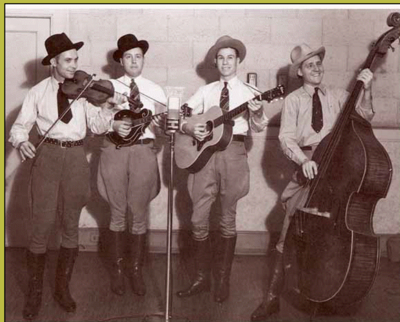
Bill Monroe et les Blue Grass Boys 🎵

I'm going down this road feeling bad I'm going down this road feeling bad I'm going down this road feeling bad, lord, lord And I ain't gonna be treated this a-way I'm down in that jail on my knees I'm down in that jail on my knees I'm down in that jail on my knees, lord, lord I ain't gonna be treated this a-way