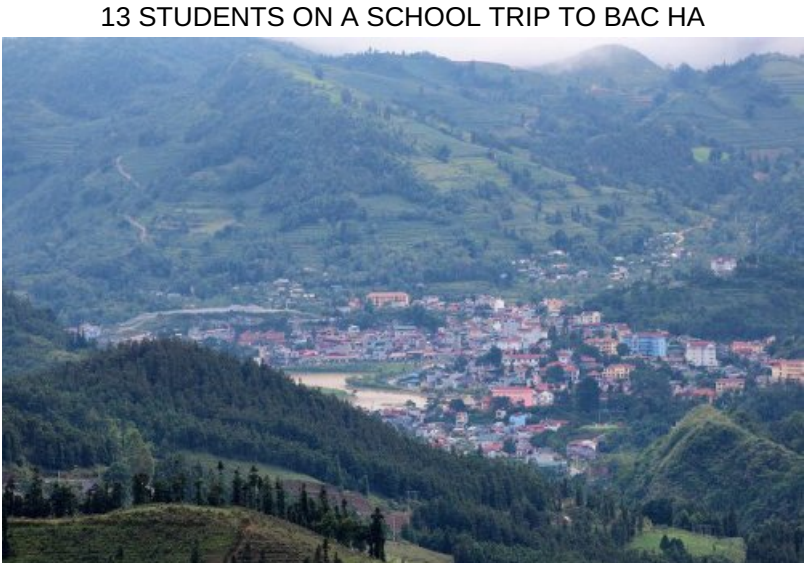
, NORTHERN VIETNAM

A project, initiated in June 2022, was to send students, specialised in topography to Bac Ha, Lao Cai province, Northern Vietnam. The latter were expected to practise and demonstrate their technical and professional skills. The project was built in partnership with the Nouvelle-Aquitaine Region, the Ministry of Foreign Affairs and Europe.