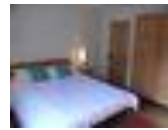
Master bedroom, king size bed