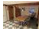
Dining area opening out onto the garden