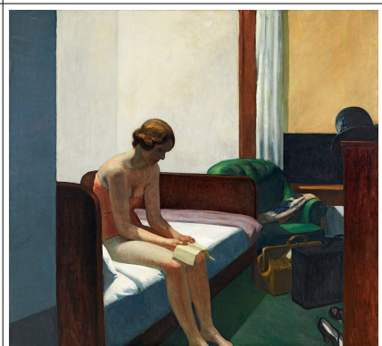
Hotel room 1931