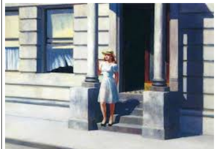
Summer time 1943