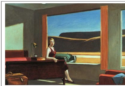
Western Motel 1957