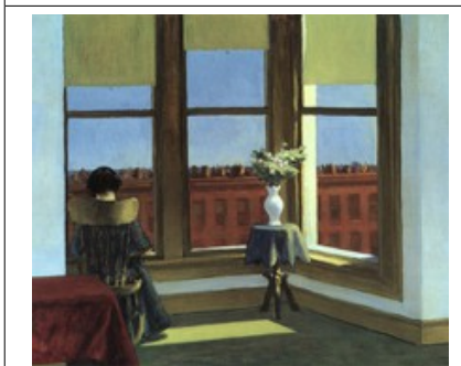
Apart Brooklin 1932