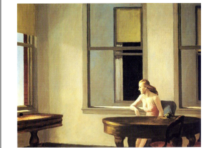
City in the sunlight 1954