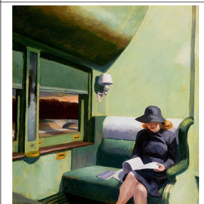
Compartment C car 1938