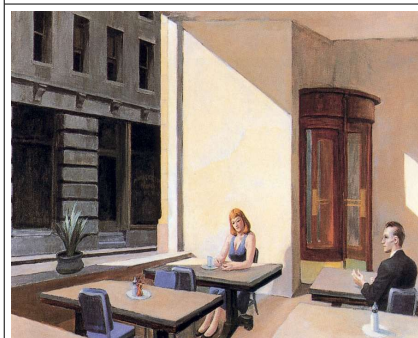
Sunlight in a cafeteria 1958