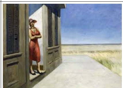
South Carolina morning 1955