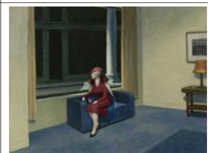
Hotel window 1955