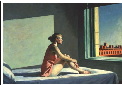
Morning sun 1952